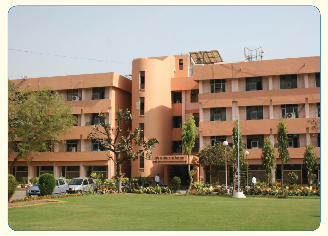
National Institute of Public Cooperation and Child Development, New Delhi

The National Institute of Public Cooperation and Child Development, popularly known as NIPCCD, is an autonomous organization functioning under the aegis of the Ministry of Women and Child Development, Government of India. Established in the year 1966, under the Societies Registration Act of 1860, it is a premier organization devoted to promotion of voluntary action and research, training, and documentation in the overall domain of women and child development.