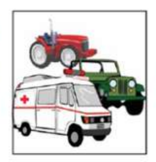
Arrange for Transport in Advance