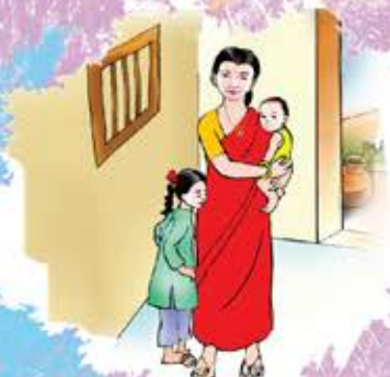
A girl may not be able to take proper care of children when she has children at an early age