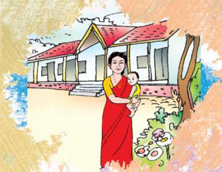
Early marriage of girls leads to early childbearing by girls