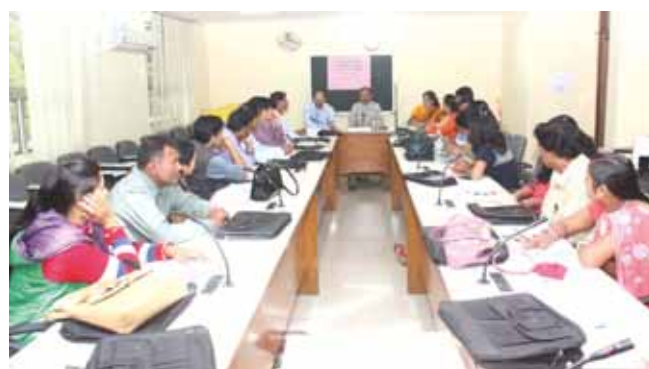
A glimpse of the Orientation Programme on Sustainable Intervention Strategy for Management of Women SHGs