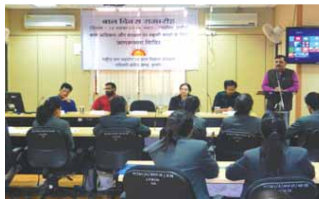
Awareness Generation Camp for School Children on Child Rights and Protection