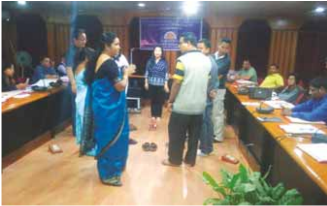
A life skill session on empathy skills during the Skill Training on Life Skill Education for Adolescent Girls for District Level Officials of ICDS and NHM

Besides, a Regional Meet for Multi-stakeholders on Preventive and Promotive Strategies for Girl Child Survival was also organized by Regional Centre, Lucknow with the main objectives to: discuss the various existing strategies/models for prevention of girl child survival and discuss the points of convergent actions required for promotion of girl child survival. The course content broadly covered sharing of existing strategies/models for prevention of girl child survival by different stakeholders; develop a framework for a multi-sectoral plan of action to promote girl child survival; and priorities key multi-sectoral interventions for accelerating action.