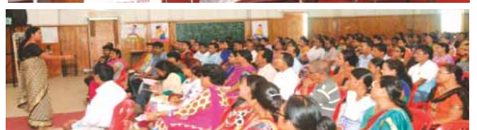
Snapshots of Parental Workshop during the year 2016-17