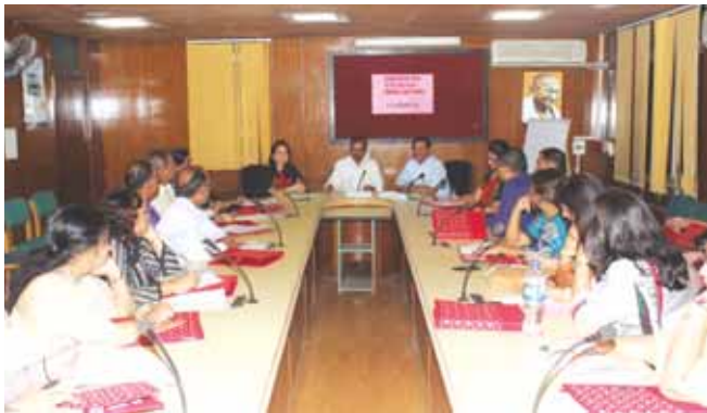
A glimpse of the Workshop on POCSO Act, 2012 for school teachers

certain statutory obligations for sensitive handling of the child by the police. Keeping the above in view Institute's Headquarters and its Regional Centres organized a series of Orientation Programmes/ Workshops/Awareness Camps on POCSO Act, 2012 for SJPUS/NGOs/ Elected Representatives of Panchayati Raj Institutions/ School Principals and Teachers/Counsellors/Voluntary Organisation/ Medical Professional/ DCPOs/Youth Clubs/Youth Groups and Functionaries of CCIs with the main objectives to: enhance the knowledge of the participants about salient features of POCSO Act and Rules, 2012 and the roles and responsibilities of various stakeholders, including police therein; discuss methods of handling cases of child sexual abuse; and discuss the problems in the implementation of the Act and skills to handle cases of child sexual abuse. The content included: Child Rights: An Overview with Specific Reference To Rights of Child Victims of Sexual Offences/Child Survivors; Salient features of the 'Protection of Children from Sexual Offences' (POCSO) Act and its Rules 2012; Role of Police Officers in Dealing With Cases Of Child Sexual Abuse; Understanding Child Sexual Abuse, Children's Consequential Trauma and its impact on them.