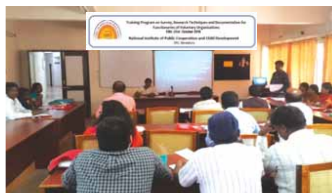
A glimpse of the session being undertaken in the Workshops on Research and Documentation Techniques in Social Development Projects for Representatives of Government and Voluntary Organizations

In this series, an Orientation Programme on Research Methodology and Statistical Analysis in Social Sciences for Academicians, Research Scholars and Research Organizations was organized by Regional Centre Indore with the objectives to: orient participants on latest trends in the use of research methodology and statistical analysis in social sciences; enhance their knowledge and skill on different components of research