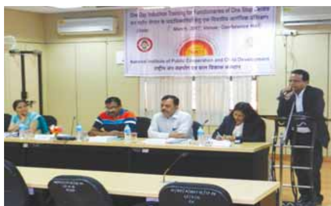
One Day Induction Training for Functionaries of One Stop Centre at NIPCCD Regional Centre Indore

Besides, one Consultation Meet on Development of Training Strategy for Functionaries of One Stop Centres was organized by the Institute's Headquarters, with the objectives to: formulate a training strategy for functionaries of OSCs across cadres and geographical areas; firm up the content for the training of OSC functionaries; sharing of best practices in training of OSCs; and build a repertoire of IEC material.