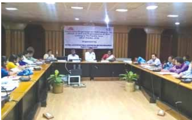
A glimpse of the Sensitization Programme on Child Labour for the officials of SSA and Representatives of NGOs working in Tea Garden areas