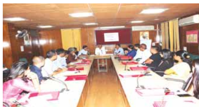
Shri R.P. Pant, Director, interacting with the participants of the Master Trainer Workshop on Documentation in ICPS for ICPS Functionaries

The Integrated Child Protection Scheme (ICPS) was launched to the realization of Government/State responsibility for creating a system that will efficiently and effectively protect children. It is based on cardinal principles of “protection of child rights” and “best