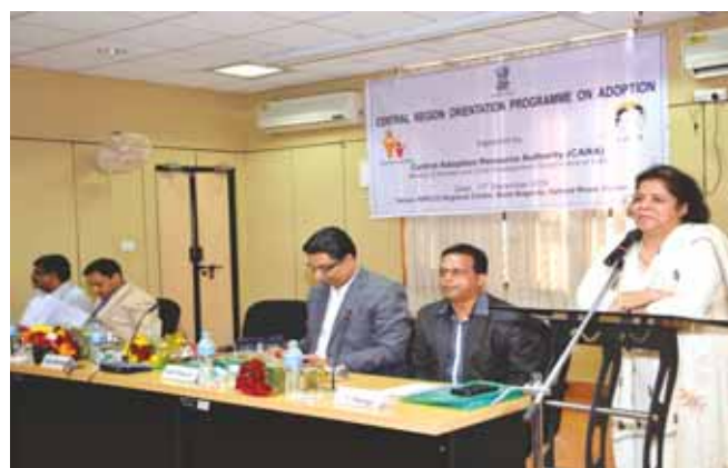
A view of Orientation Programme on Adoption organized by Central Adoption Resource Authority (CARA) in collaboration with the Institute at Indore

guidelines and procedures for adoption, foster care and UID Aadhar enrolment as a requirement of children to be given in adoption; and expose the participants to the working of CARINGS. The contents included: understanding child protection with specific reference to adoption; Juvenile Justice ( Care and Protection of Children) Act, 2015 with specific reference to children in need of care and protection and ICPS; guidelines and procedure of adoption; foster Care; UID Aadhar Enrolment as a requirement for children to be given in adoption; Child Adoption Resource Information and Guidance System (CARINGS) and issues related to online adoption; SAA-CCI Linkage; CARINGS and issues related to Online Adoption; CARINGS, Training Module & Instructions Manuals; counselling of children and prospective adoptive parents; training modules for stakeholders and role of master trainers.