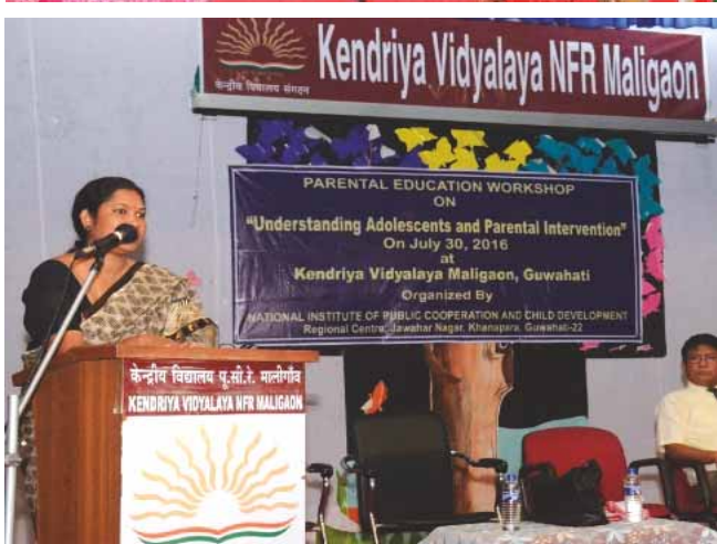
Snapshots of Parental Workshop during the year 2016-17